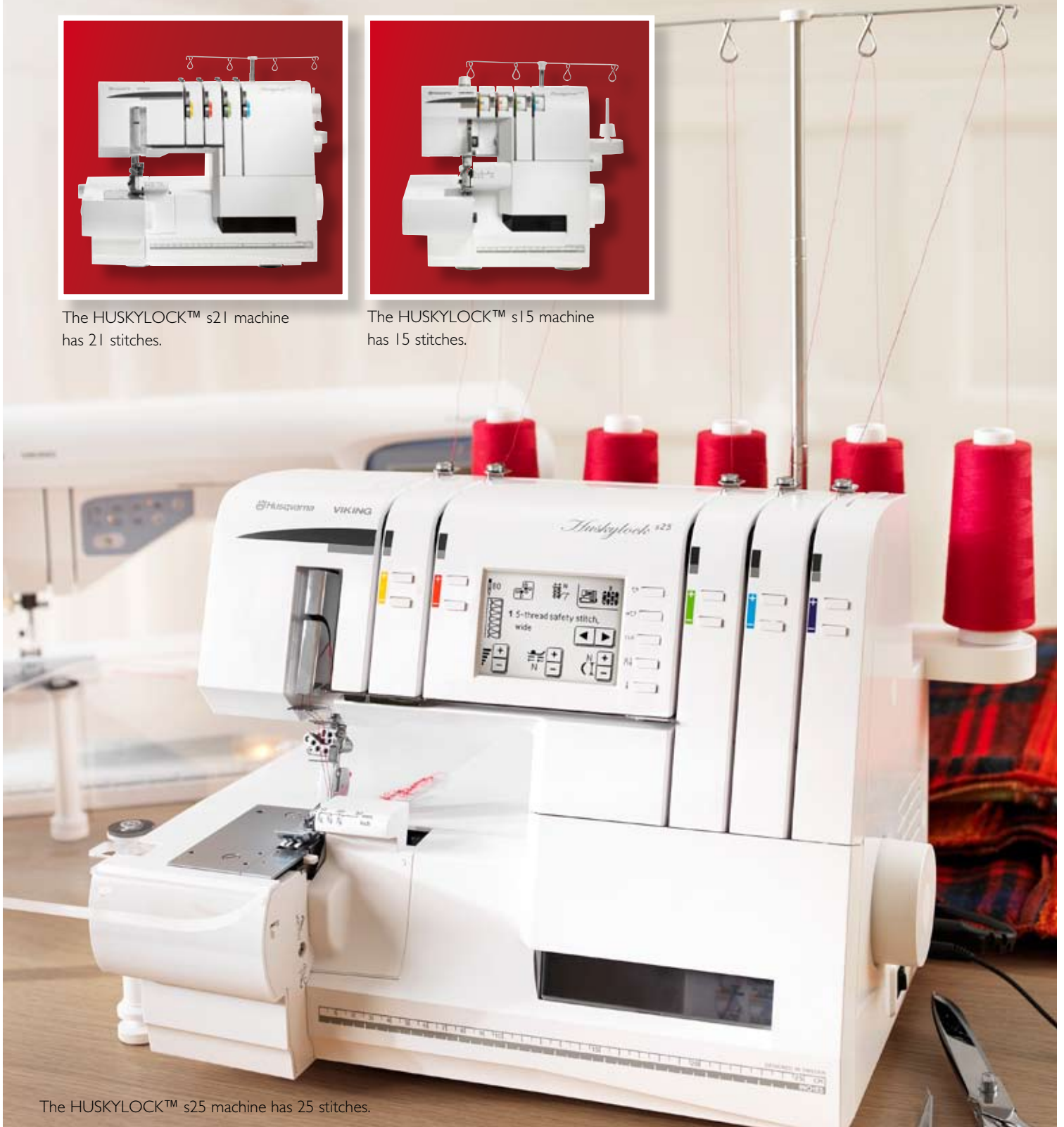
The HUSKYLOCK™ s25 machine has 25 stitches.

The stunning garments and home dec items shown are anything but ordinary. Just like the HUSKYLOCK™ overlock machines, they are innovative from the inside stitches to the outside hems and will inspire you to create unique projects that showcase the convenience and joy of owning a HUSKYLOCK™ overlock. Whether you are just starting your serging journey or are an experienced enthusiast, the HUSQVARNA VIKING® overlock family has an option for you. Your ideal sewing companion awaits.