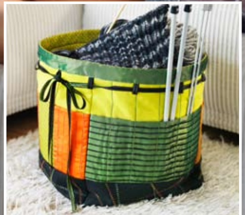
Knitting basket with decorative overlock stitching and pockets for needles.