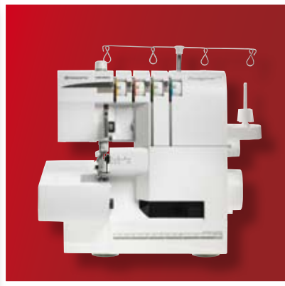
The HUSKYLOCK™ s15 machine has 15 stitches.