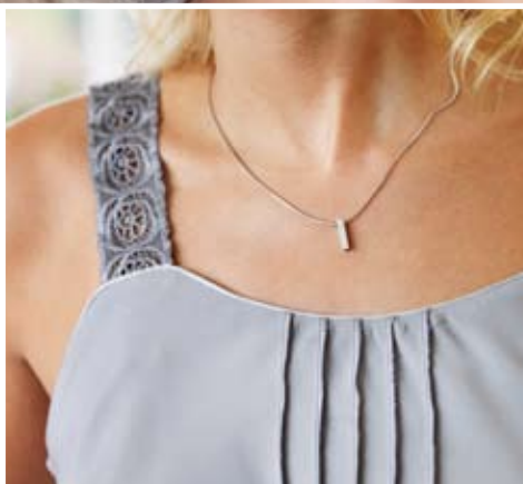
Camisole with beautiful overlock pintucks and embroidered straps.