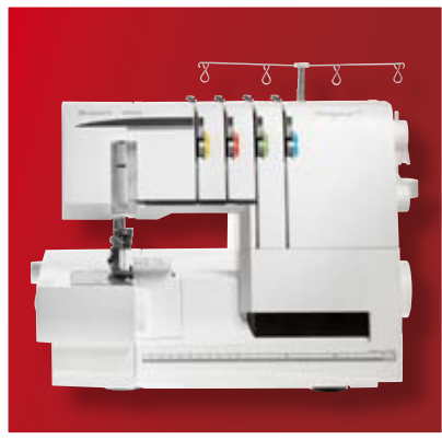
The HUSKYLOCK™ s21 machine has 21 stitches.