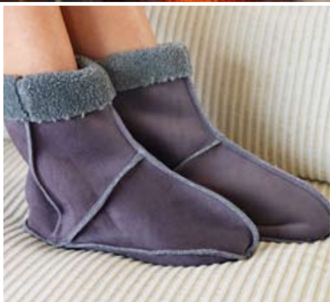
Comfortable slippers with overlock stitches.